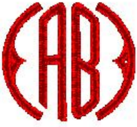
1 or 2 LTR